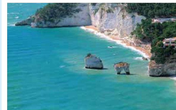
FARAGLIONI BAIA DELLE ZAGARE