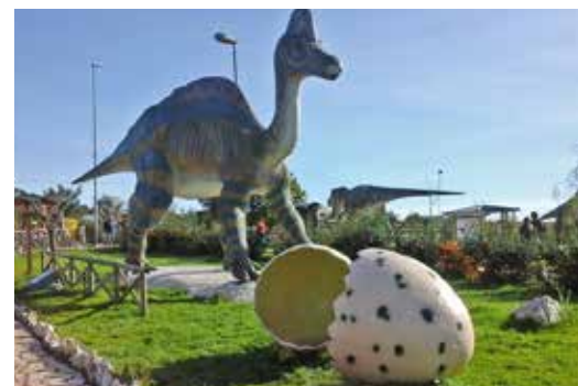
PARCO DINOSAURI DEL GARGANO BORGO CELANO