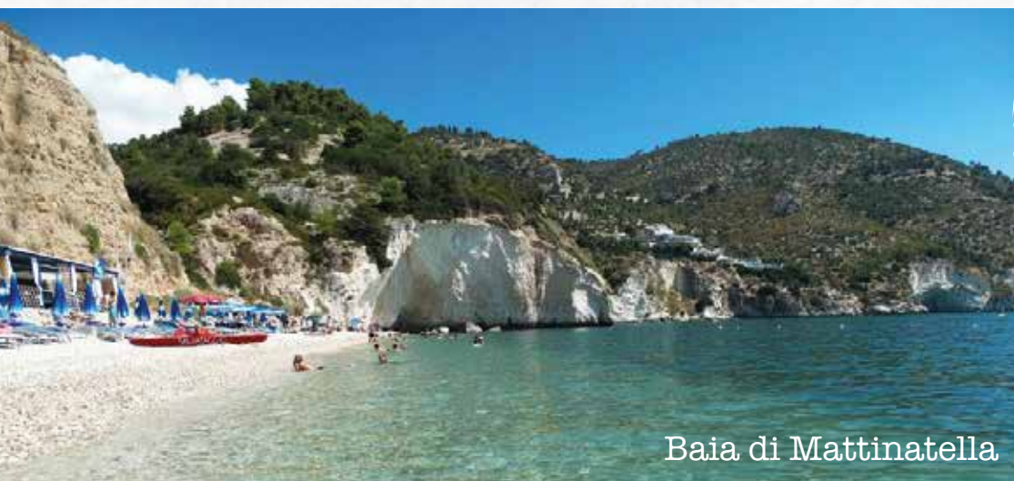
Baia di Mattinatella

Baia dei Faraglioni - limited access; The Tourism Office in Mattinata gives 20 pass a day to get to this amazing beach. We suggest you to go to the Info-Point in Mattinata before the opening of the Office.