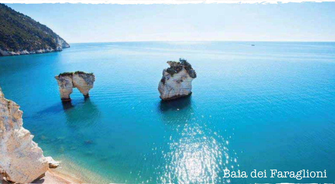
Baia dei Faraglioni

Baia dei Faraglioni - limited access; The Tourism Office in Mattinata gives 20 pass a day to get to this amazing beach. We suggest you to go to the Info-Point in Mattinata before the opening of the Office.