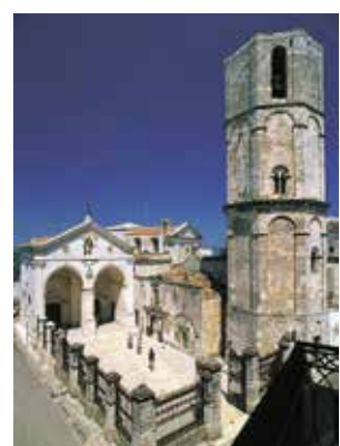
MONTE SANT'ANGELO BASILICA DI SAN MICHELE ARCANGELO